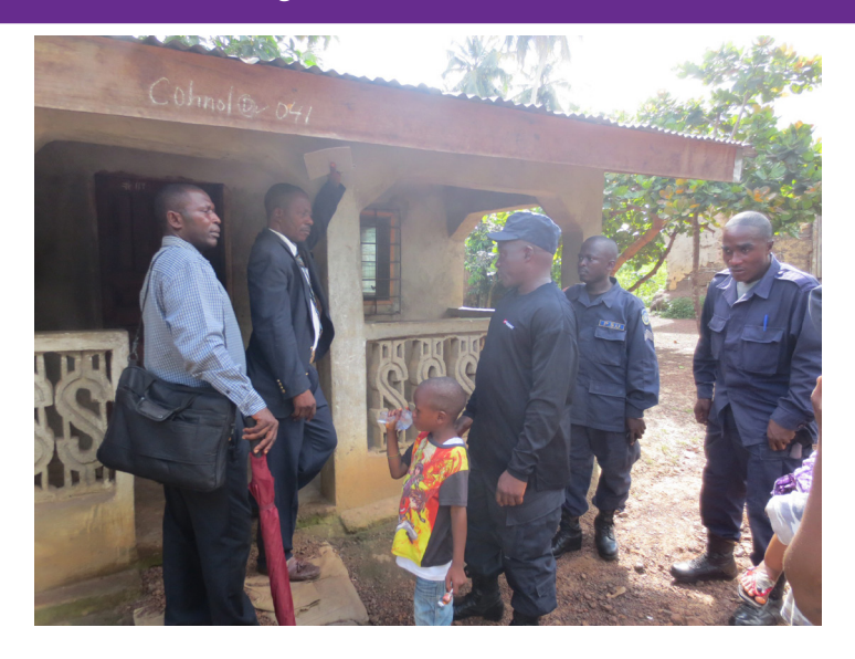
Figure 2: PSU officers meeting with citizens

After the public meetings, the PSU officers walked throughout the community in small groups to engage with citizens.