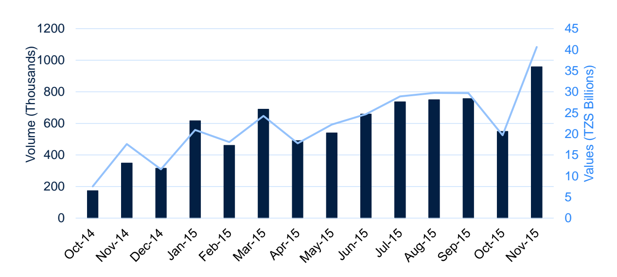
Figure 1: Off-net wallet-to-wallet transfers in Tanzania, Oct. 2014-Nov. 2015

The following figure (from Warioba, 2016) shows the evolution of wallet-to-wallet off-net transfers since the fall of 2014.