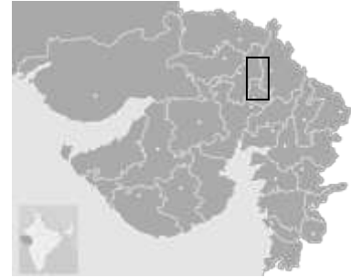
Figure 1. Map of the study area. Lines show the administrative boundaries of the sub-districts of Gandhinagar, Mahesana and Sabarkanta districts. Villages included in the survey are indicated in dots, and the mean reported decline in well depth is indicated by the colors.