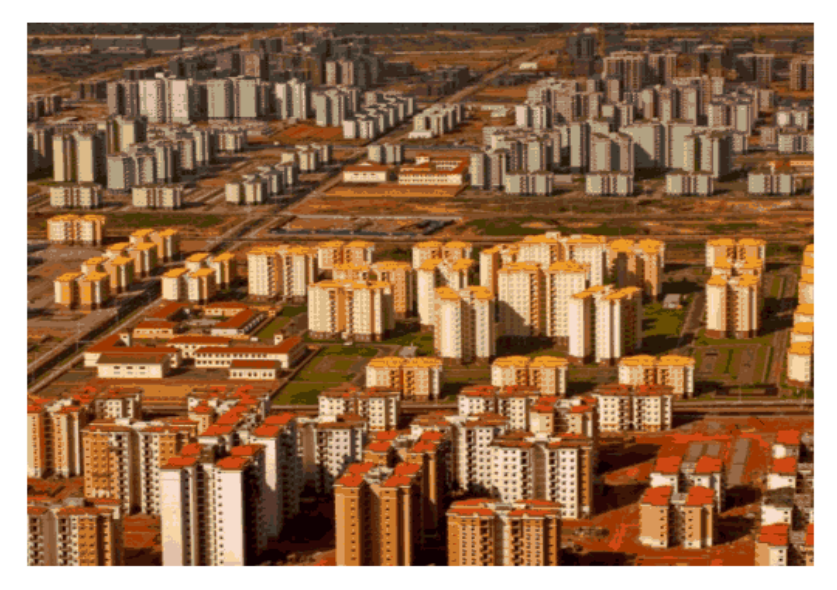
New City of Kilamba, Luanda, Angola

The point is while there are an almost infinite number of ways to proceed, given Rwanda's demographic and income profile, policy-makers there are in a sense "doomed to choice." Choices, even doing nothing, have to be made. The default of doing nothing can set back the development agenda by years, but so too can the implementation of a program in which the details are not carefully thought out.