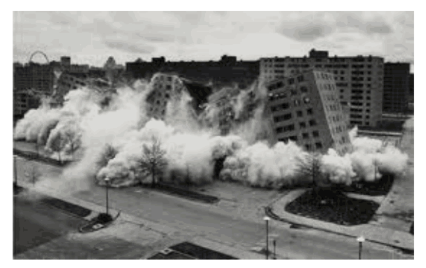
Destruction of the Pruit-Igoe housing development, St Louis, 1972

these policy errors made just in countries in the global North.