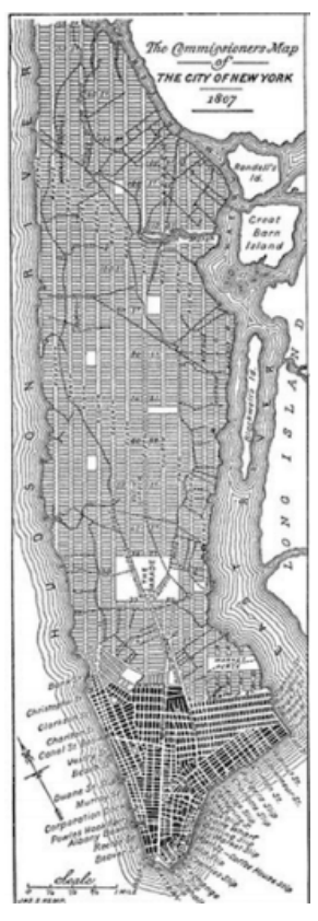
The New York City Grid Plan, 1807

plan to manage its street development in a simple, straightforward way that kept mobility and access high. The following figure depicts this plan which was made when 50,000 people lived on the tip of the island of Manhattan, rather than the millions who covered the rest of the grid as it was filled in over the next century. Barcelona followed a similar design strategy in the mid-19<sup>th</sup> century. In the long run such city street grids will minimize the problem of large informal settlements on the periphery, avoiding mass evictions as the city grows further.