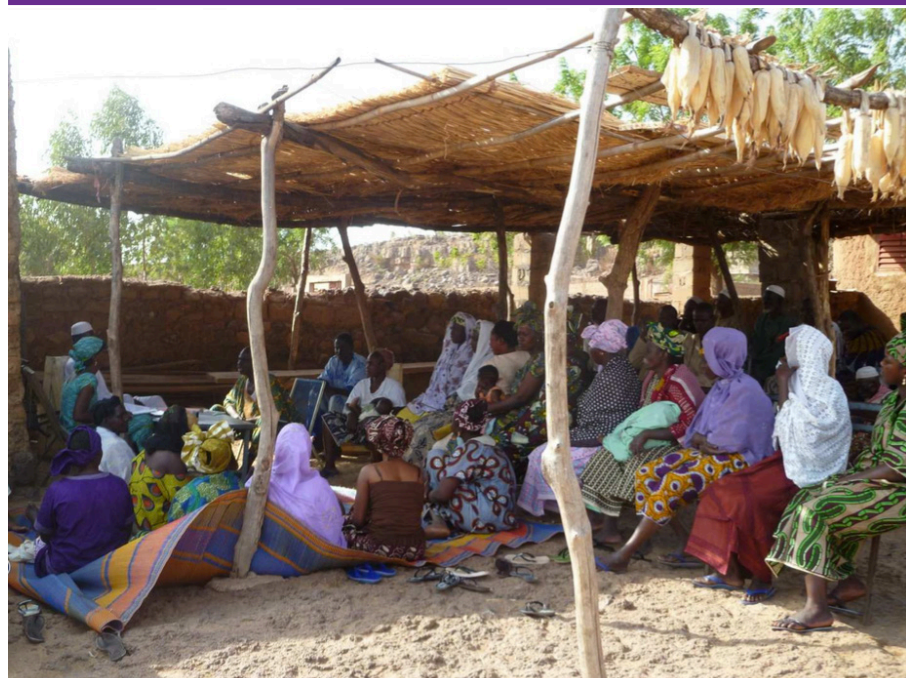
Figure 1: A Village-Level Civics Course led by a Female Instructor