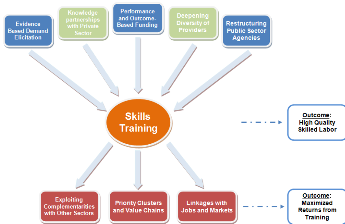
Summary Figure 2. A New Model for Skills Training in Punjab