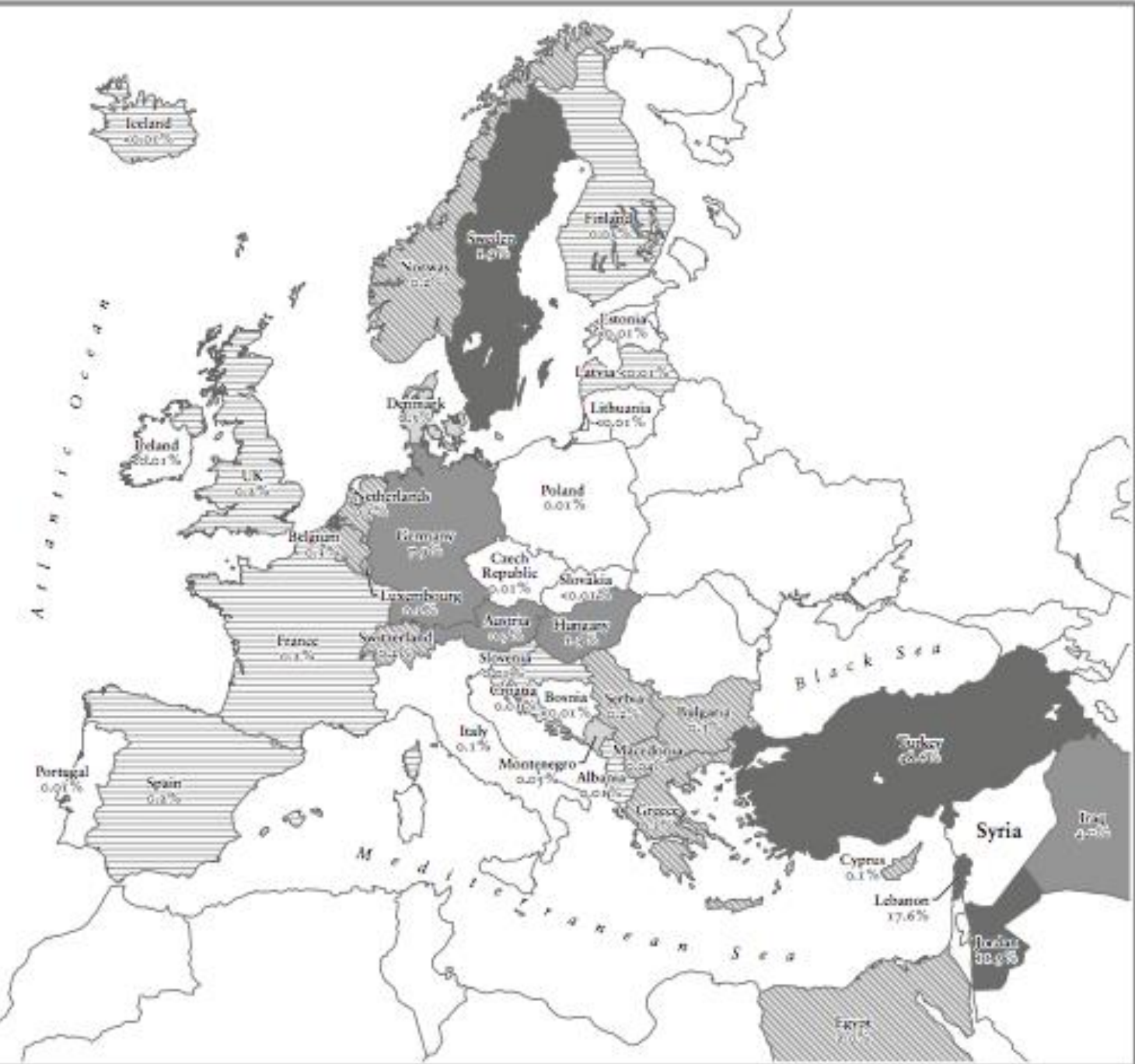
Distribution of Syrian Refugees