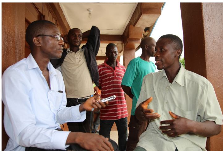
Focus group discussion with artisanal miners near Koidu, Kono District, July 2016

In order to capture a broad range of perspectives, fieldwork was confined to Kono District, the country's main diamond bearing region, and Kenema District. Multi-sited research took place in a series of diamond mining communities where the researchers have been working for many years, and where strong rapport had already been established with a diverse range of stakeholders. Qualitative data were generated using a suite of methods derived from the Rapid Rural Appraisal family, including transect walks, semi-structured interviews, focus group discussions, and life histories with miners. In total, 30 key informant interviews were carried with a wide range of actors, including: diggers, supporters, traders and middlemen, Chiefs, elders, and a number of government officials involved in policy formulation.