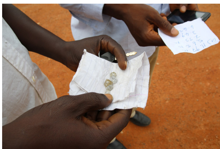
Diamonds for sale? Kono District, July 2016

But whilst the ‘blood diamonds’ era may have come to end in Sierra Leone, many challenges remain. One of the most significant has been ensuring that all diamonds mined in Sierra Leone are accounted for in Sierra Leone. There is reason to believe that, in spite of the plethora of paperwork, checks, and confirmations that have come with a commitment to the Kimberley Process, Sierra Leone still provides fertile grounds for rampant diamond smuggling. There are several factors that contribute to this illicit economy, the most obvious being the country’s borders between Guinea and Liberia, which remain porous and in many places, unmanned. Given the widespread cross-border sponsorship and more appealing export taxes (in Guinea and Liberia, it is 3%, whilst in Sierra Leone, it is 5%), it is not a question of if smuggling is taking place but rather a question of where it is taking place.