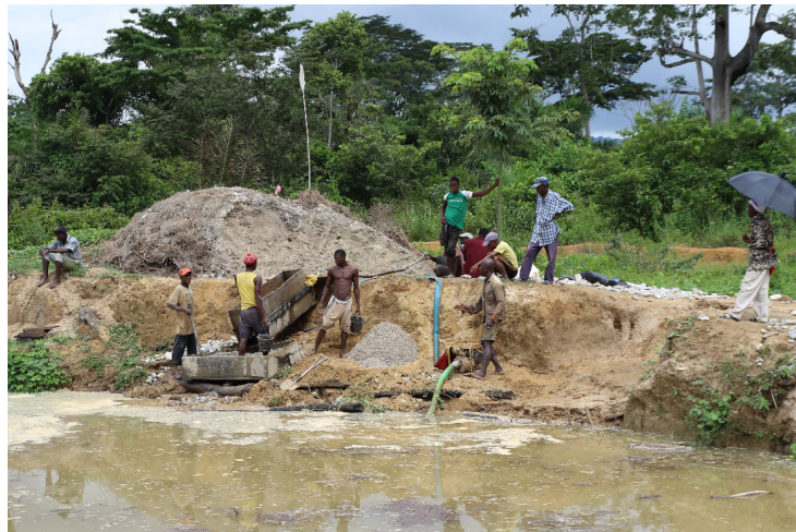
Artisanal diamond miners near Kenema, Kenema District, July 2016