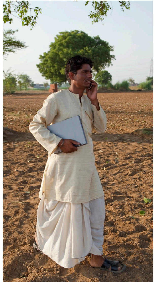
Farmer in India.