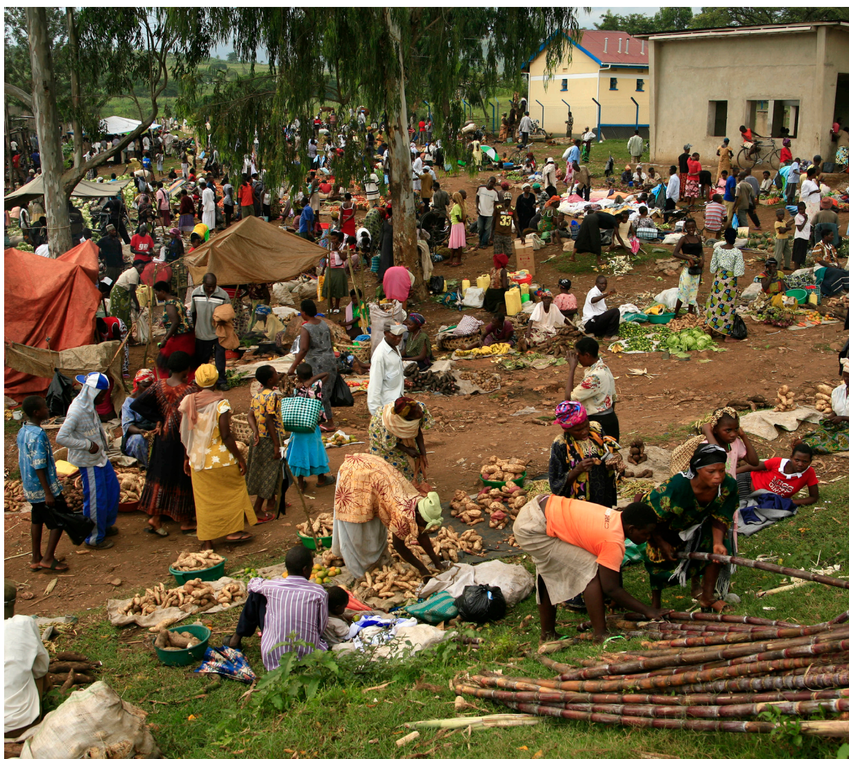
Market in Uganda.

Much of the recent research on agricultural technology adoption assumes that quality inputs are available and focuses instead on demand-side barriers to uptake. However, supply-side challenges, including the availability of the technology in the first place, should not be ignored. Better information, whether about product quality or about agricultural practices, has a key role to play in addressing both these challenges.