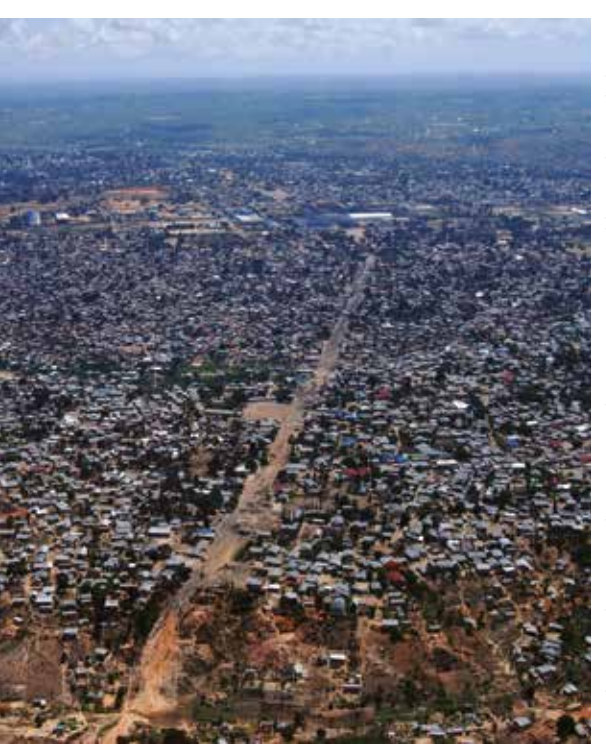
ow density urban sprawl in Dar es Salaam, 2009, Source: bbmexplorer, Flickr

criminalised. The result is informal, unplanned urban sprawl. Evidence suggests that lifting height restrictions in Bangalore, India, would result in a 17% reduction in city size, reduce commuting costs, and increase household savings by between 1.5% and 4.5% of earnings (Bertaud and Brueckner, 2005).