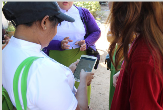
Municipal staff in Taunggyi use Myankhon. Before the app, property tax collection in the city took nearly six months to finish, now it takes two months with barely any paperwork.

The pilot of Myankhon shows that digital platforms can generate practical administrative and policy-relevant advantages for property taxation. Moreover, it could be a valuable technological innovation that could be rolled-out across other municipalities in Myanmar. With more widespread digital record keeping, there could be further improvements in efficiency – such as consolidated record keeping at the regional level and more automated billing procedures.