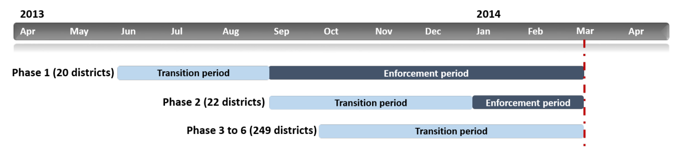
Figure 2: Implementation timeline: Direct benefit transfer for LPG policy

Non-policy districts: remaining 349 districts