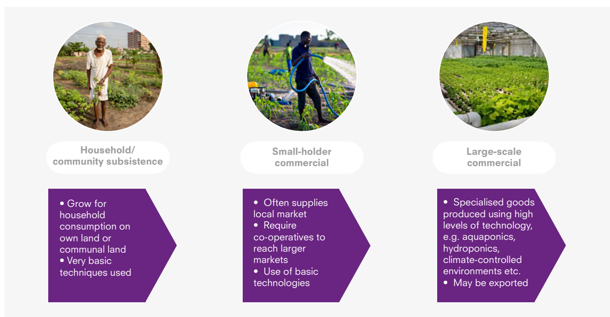
Figure 2: Spectrum of urban agriculture from subsistence to commercial

* Excludes the areas irrigated with wastewater and small-scale urban areas