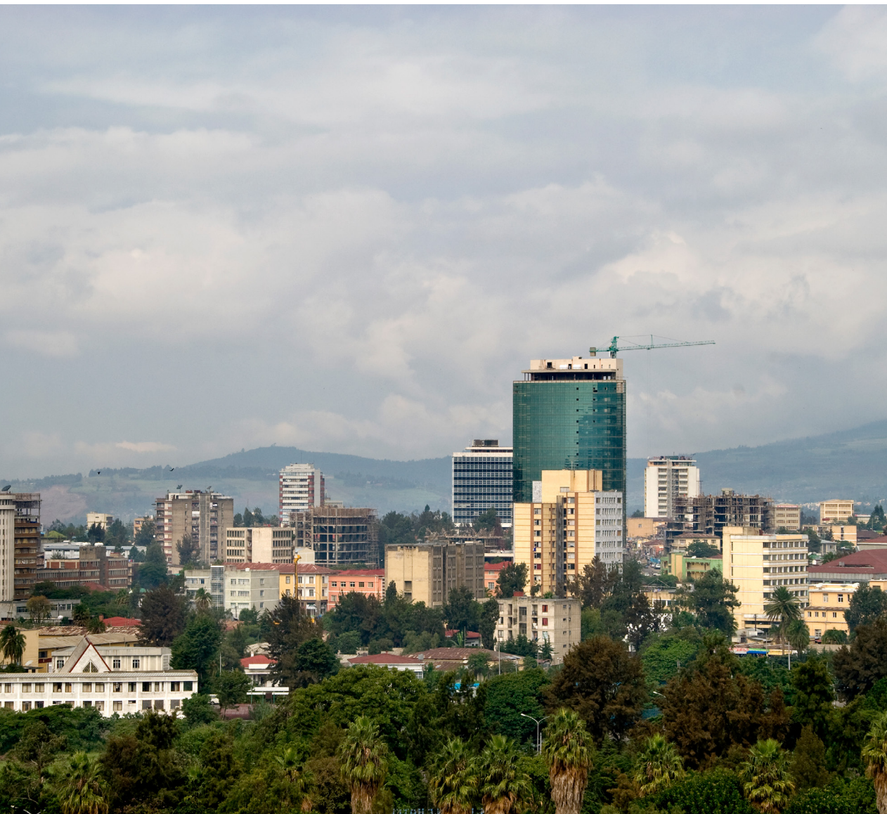
City view over the skyline of Addis Ababa, Ethiopia.

Together, this describes the city at baseline. To evaluate the impact of a policy or infrastructure intervention, the user needs to manipulate one of the fundamental characteristics of the city (a change in amenities, productivity, density of land development or commuting times) and compare the outcomes. For example, changing commuting speeds along a new BRT route, or increasing the amenities score to simulate neighbourhood regeneration projects.