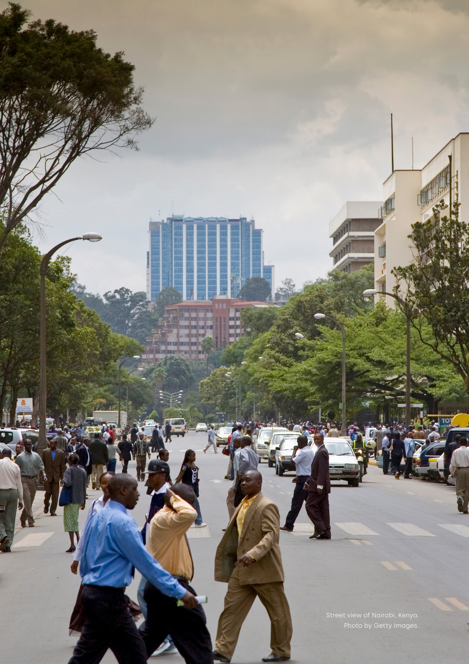
Street view of Nairobi, Kenya.