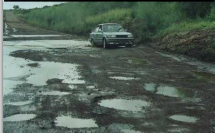
N4 ROAD ON THE MAPUTO CORRIDOR BEFORE CONCESSION